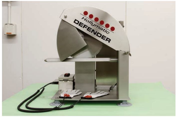
Standard 9" diameter cutting blades.