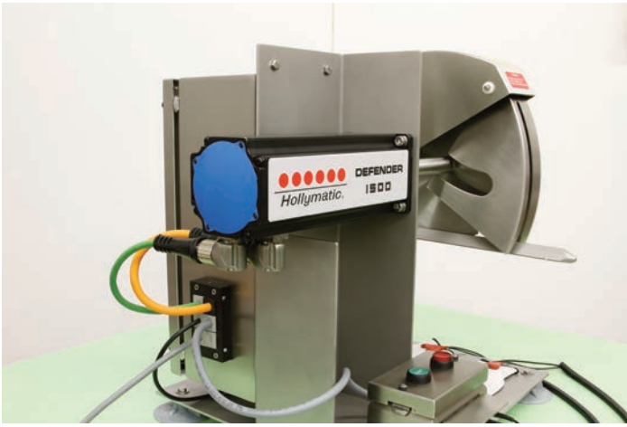
Powerful 2 HP servo motor, also available in stainless steel.