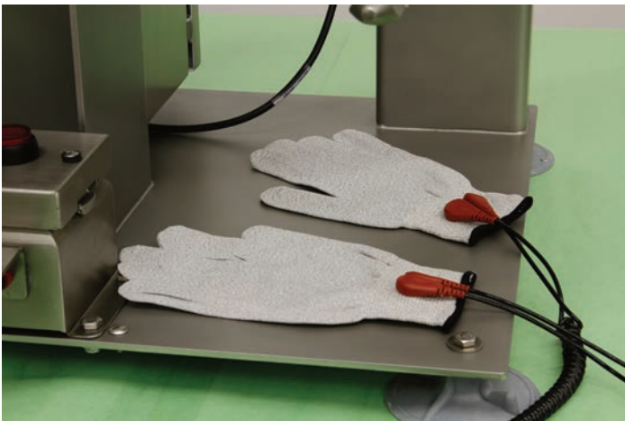
Special conductive gloves worn by the operator activate a patented braking mechanism, stopping the blade within 15 milliseconds of unintended or inadvertent contact with the blade.